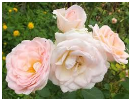
Stop and smell the roses

What's the secret to a long and healthy life? All centenarians have their own habits and morning routines they swear by. In the February 2014 DSV Newsletter we covered 1 to 50. Here we cover 51 to 100.